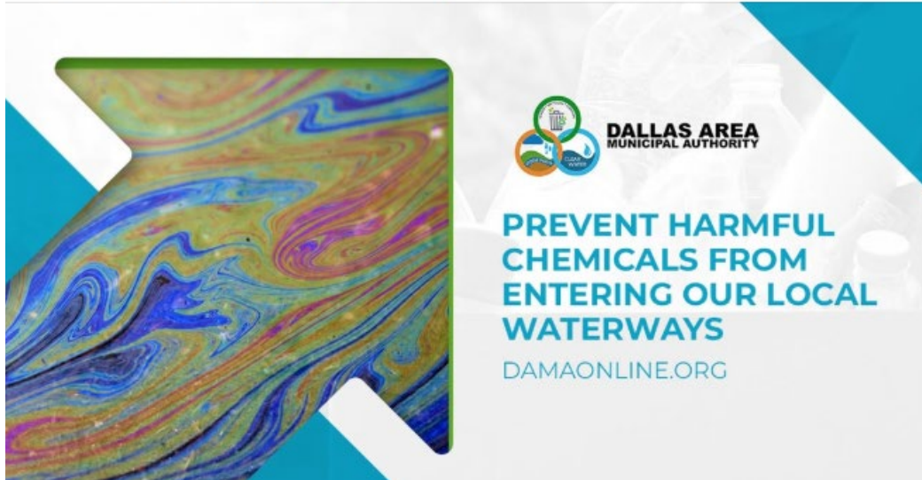
Figure 1: DAMA Prevent Harmful Chemicals Education Post

After battling salt and grime on our Pennsylvania roads, rinsing off your car is important—but it's equally crucial to protect our local waterways. Opt for commercial car washes or unpaved surfaces to ensure harmful chemicals don't pollute our rivers and streams. Learn more about our stormwater management program. https://ow.ly/Fa8b50UFyyw